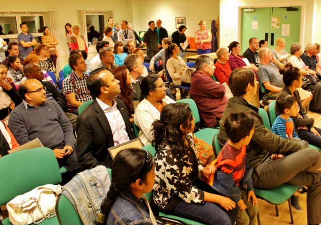
Learners and their families at our last celebration event