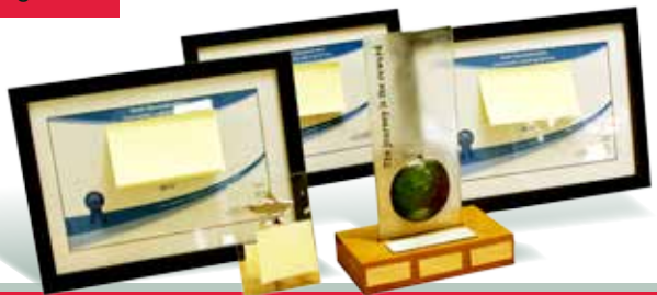
The Community Learning awards